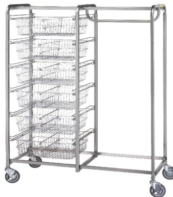
Garment Hanger Resident Item Cart