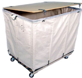
Lockable Wood Covered Trucks