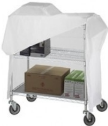
Linen Cart Cover