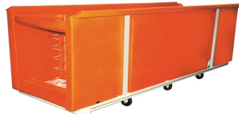
Spring Lift Platform Trucks