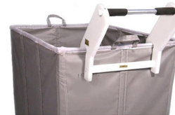
Push & Pull Handles