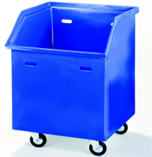
Square Linen Truck