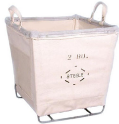
Square & Round Carry Baskets