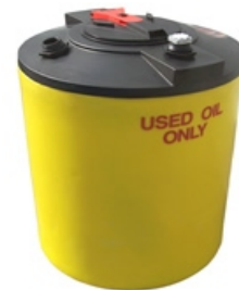
Used Oil Storage Tank