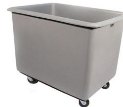
Industrial Laundry Truck