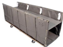
Sheet Feed Trucks