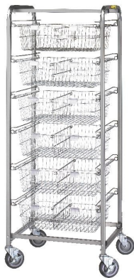
Resident Item Cart