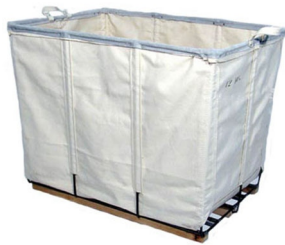
Baskets Without Casters