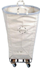
Round Baskets & Trucks