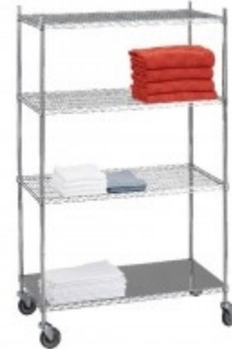
Linen Cart w/ Solid Bottom