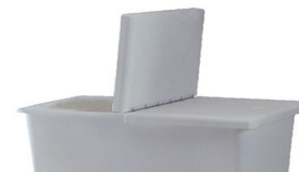
Hinged Poly Lid