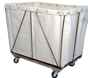
Removable Style Trucks