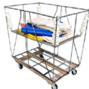
Spring Lift Platforms