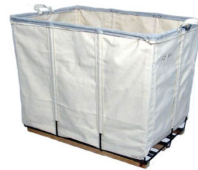
Baskets Without Casters