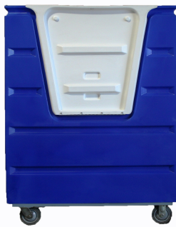
Bulk Delivery Carts