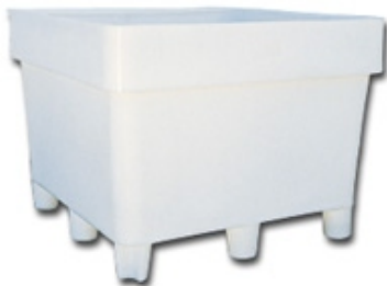
Bulk Fork Lift Container