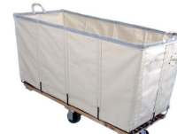
Narrow Aisle Trucks