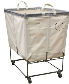
Elevated Style Trucks