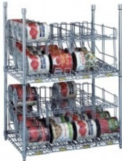
Can Rack System