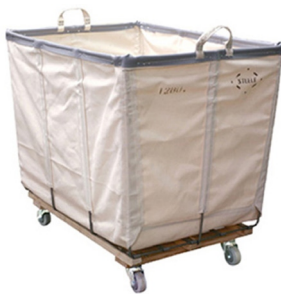
Permanent Style Trucks