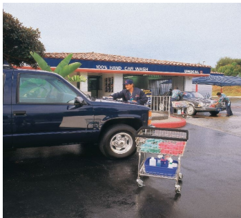
Car Wash Towel Cart