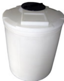
Double Wall Bulk Storage Tank