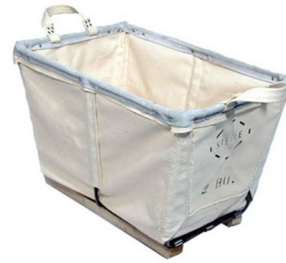
Small Carry Baskets