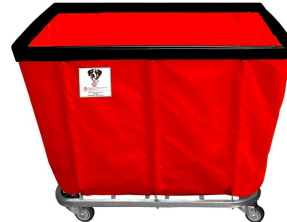
Permanent Liner Truck