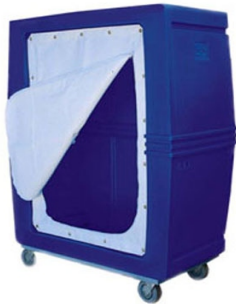
Garment Delivery Cart