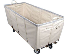
Flatwork Ironer Trucks