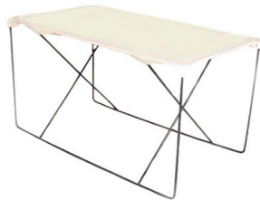
Elevated Work Benches