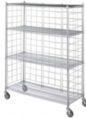
Linen Cart Enclosure Panels