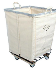
Square Baskets & Trucks