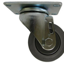
Replacement Casters & Boards