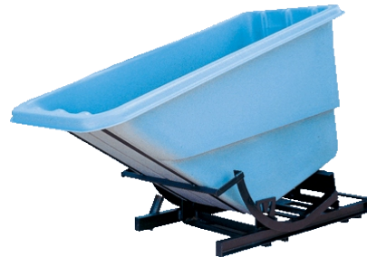
Fork-Liftable Self Dumping Hopper