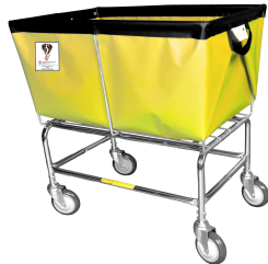
Elevated Truck w/ Sewn-On Liner