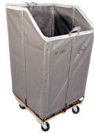
Square Soiled Linen Trucks