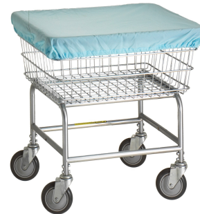
Laundry Cart Cover