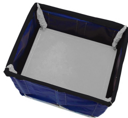
Spring Lift Platform