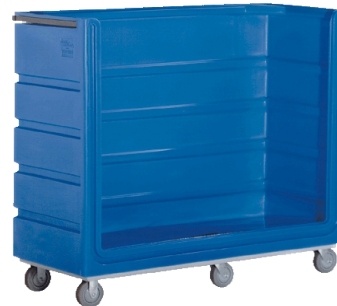
In-Plant Sheet Cart