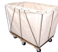
Post Office Trucks