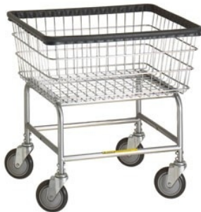
Wire Laundry Cart